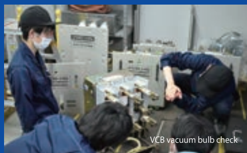
VCB vacuum bulb check

Contributes to skill development of seafarers and supports safe navigation