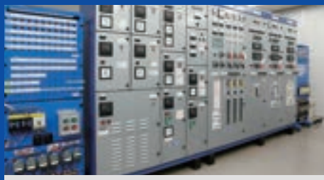
Low-voltage switchboard and starter panel simulators