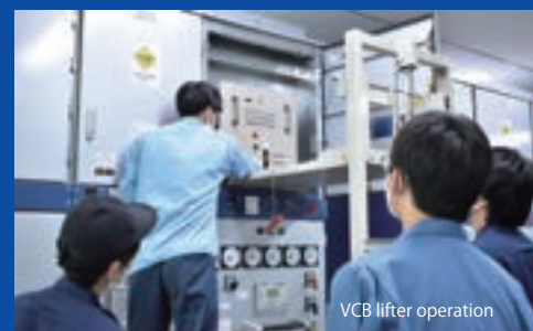
VCB lifter operation