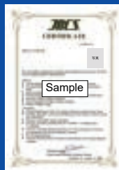
Issuance of certificate *No ClassNK certification mark

General electrical knowledge + Drawing reading method of starter panel + Practical training of motor control circuit simulator (2 days)