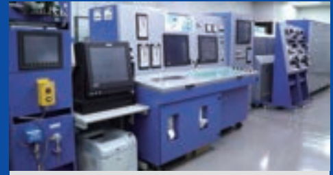
Engine control console and alarm & monitoring system simulators