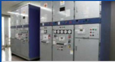
High-voltage switchboard simulator