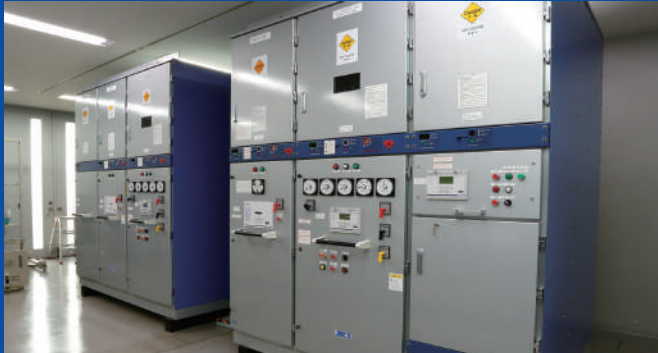
High Voltage Switchboard Simulator