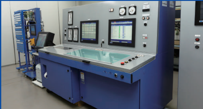
Engine Control Console & Alarm Monitoring System Simulator