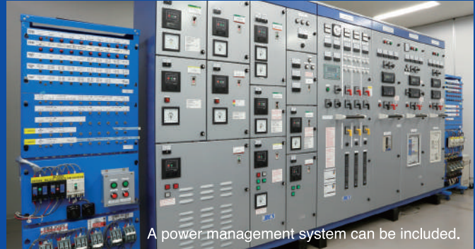
Low Voltage Switchboard Simulator