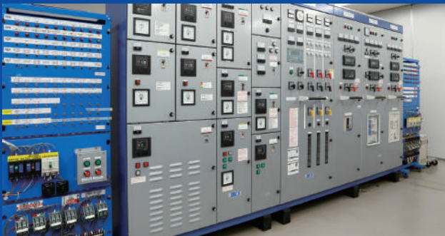
Low-voltage switchboard and Starter Panel simulators