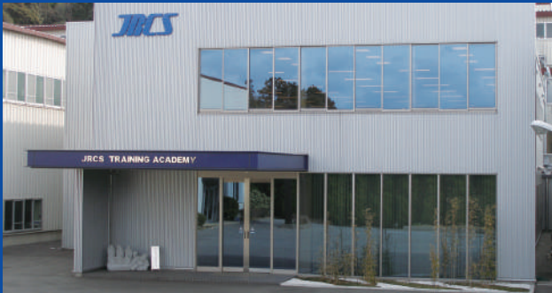
Training center adjacent to factory