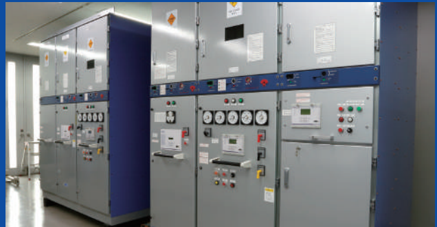
High-voltage switchboard simulator