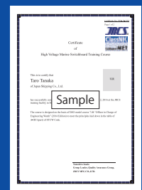
Certificate of Completion

Standard price for 2 day course: 100,000 yen per person; 3 day course: 150,000 yen per person (excluding transportation and lodging expenses)