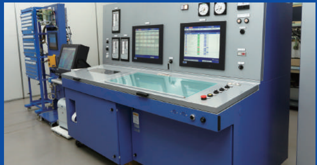
Engine Control Console and Alarm & Monitoring System simulators